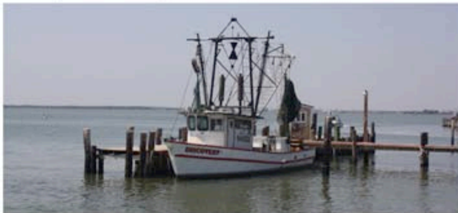
The F/V Discovery in its new home at San Leon's April Fool Point.

We're not sure how long the F/V Discovery will be in San Leon, a lot of that depends on us actually catching shrimp. But we're pretty sure this town isn't going anywhere. Like most good places on the Texas coast, it's a resilient place that has picked itself up after each hurricane. Many of the places we frequent took a battering in Hurricane Ike, but they're still here. So do yourself a favor, turn off the main road and come visit San Leon.