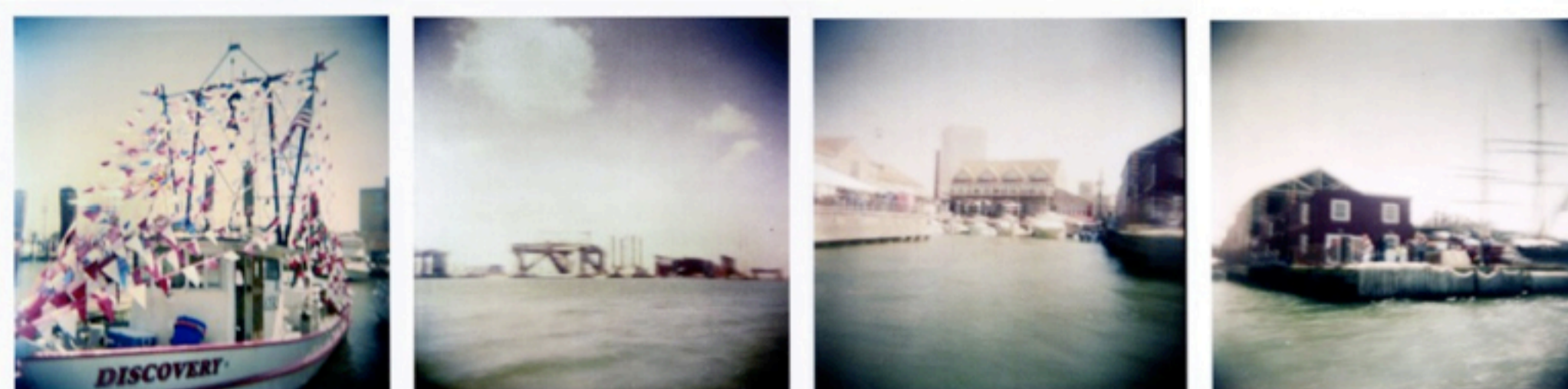
before and during the parade.

On the morning of September 23, we departed San Leon for Galveston by shrimp boat, a day before the parade. Though not terribly far (we can usually see the hazy silhouette of Galveston's skyline from our shrimping grounds), the trip would have us navigate unfamiliar waters and more marine traffic than we'd ever faced, specifically at the mouth of the bay, where the Houston ship channel meets the Galveston ship channel meets the Intercoastal Waterway meets the ferry channel from Galveston to Bolivar. The nautical chart above hints at how congested this area can get. So we took our time getting there. We detoured to a shrimping spot near the Texas City Dike, at the encouragement of John from the boatyard. The spot had come to him in prophetic dream over the summer in which he saw us catching a massive amount of shrimp. A mythical honey hole or a true shrimp bonanza? We had to find out. As it would happen, reality was not on our side. Our try-net, never shy of prophecy itself (as it's main function is to test the waters and tell us whether it's worth dropping the big net in) quickly grassed up and it was clear there was no honey hole here on this day. We continued on our way.